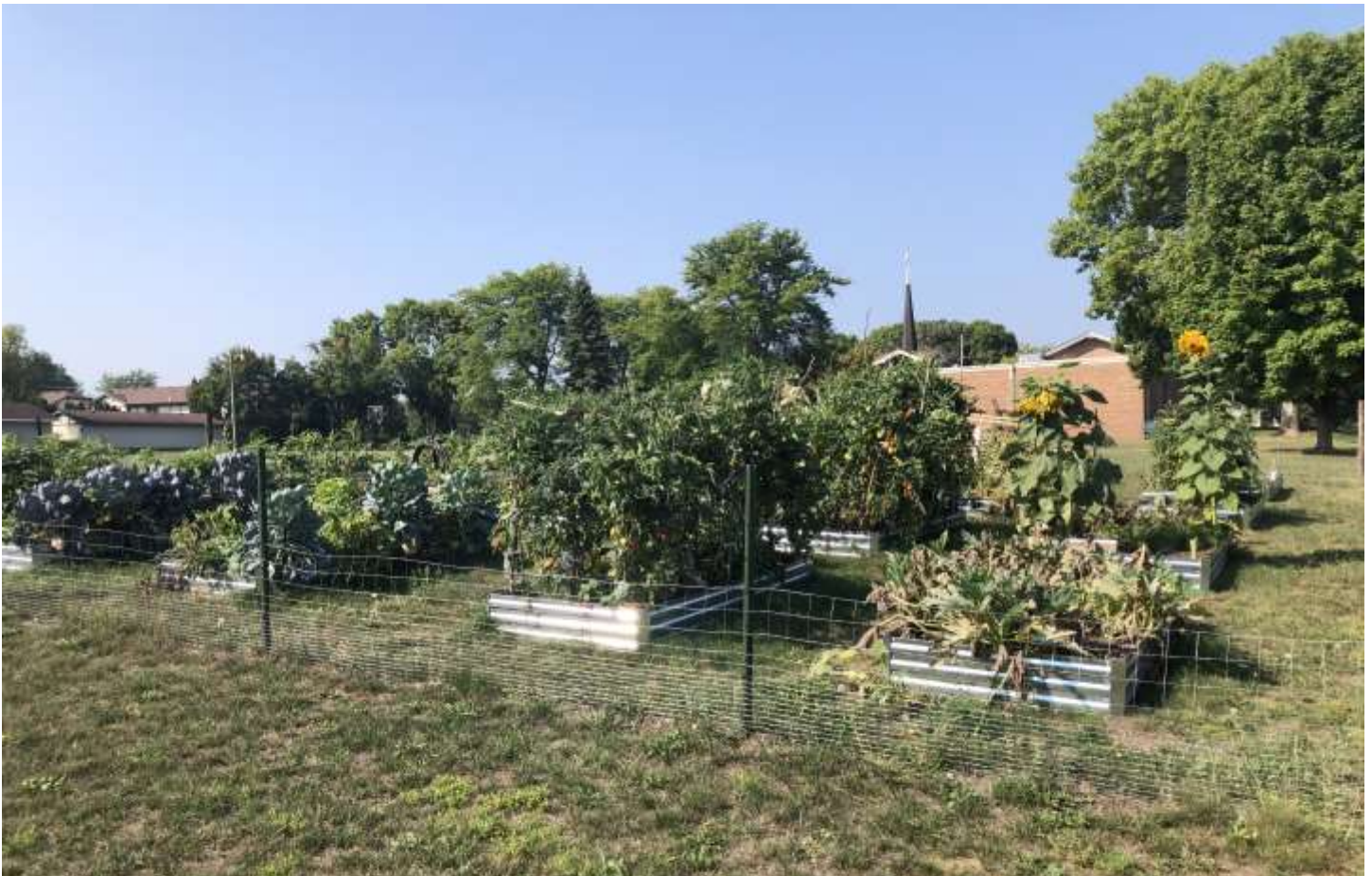
First Presbyterian Church Community Garden in full bloom.